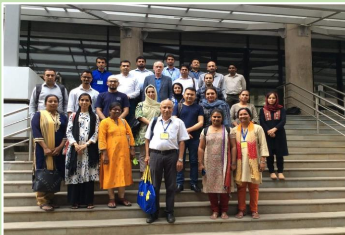
Contingent from Afghanistan