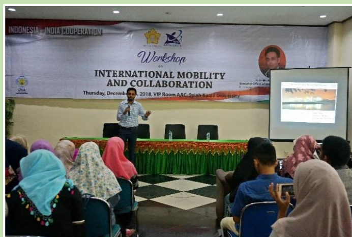
Visit to Indonesia