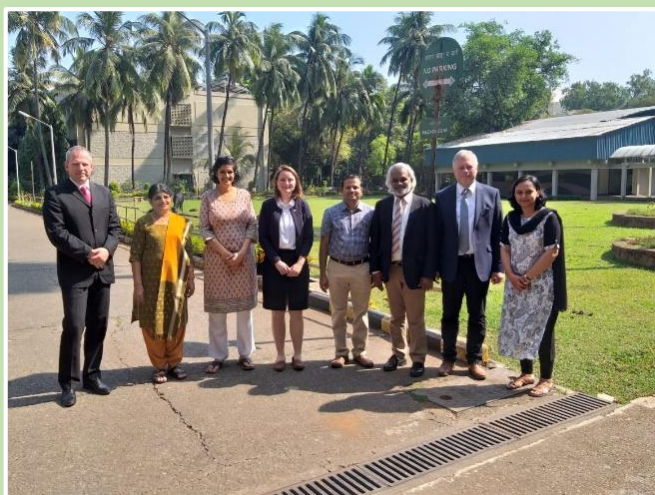
Delegation from University of Bayreuth