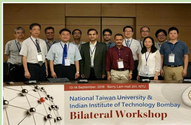
IIT Bombay & NTU, Taiwan Workshop

This two day workshop was conducted at NTU, Taiwan which started with the introductory talk on IIT Bombay and NTU from the respective leaders of the institutes followed by research presentations from professors of Electrical Engineering department of both the institutes. This workshop also had the NTU students participating. The major motive behind organizing this workshop was to strengthen the collaboration of the two institutions for eventually facilitating the existing MOU and the proposed dual degree program. The signing of this agreement is in process.