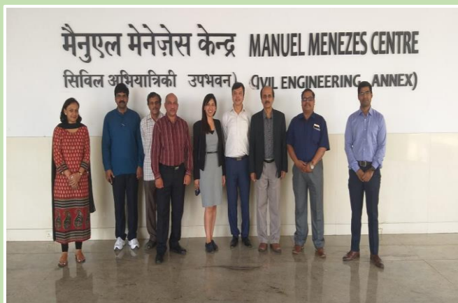
IIT Bombay & Curtin University Workshop