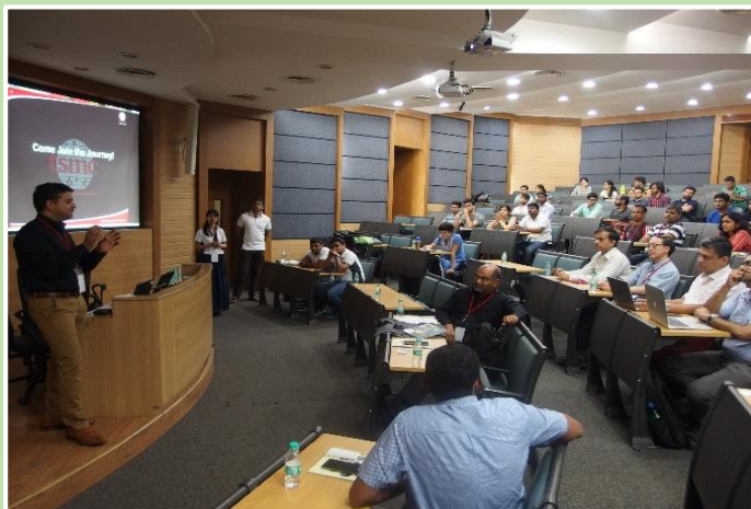
Contingent from Taiwan