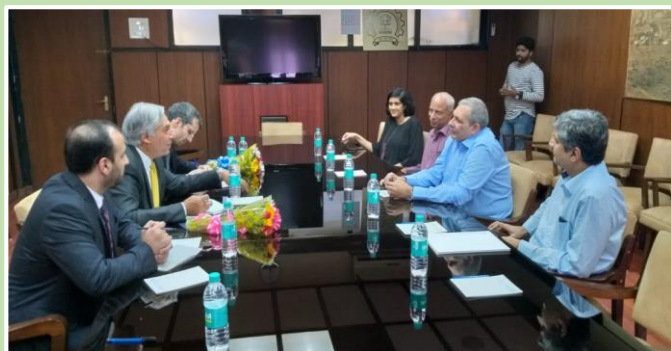
Delegation from Ministry of Afghanistan