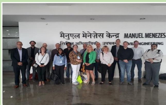
Contingent from Netherlands

A group of 5 students from School of Business and Management-Institut Teknologi Bandung (SBM-ITB), Indonesia accompanied by their professor visited IIT Bombay. As a part of their Cross-Cultural and Conflict Management course, they visit other institutes to understand the pedagogy used by the institute and also to get acquainted with the culture of the country. To broaden their knowledge on the practices to run business in India, a session was arranged wherein incubatees from SINE shared their experience on technology startups