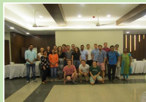
International Students - Orientation

During the autumn semester 2018, IIT Bombay had 20 undergraduate students from foreign universities for semester exchange and 11 post graduate international students. The orientation program was arranged on 13 th July, 2018 for undergraduate students, and 2 nd August, 2018 for post graduate international students. This orientation program introduces them to IIT Bombay functioning, rules and regulations. Also the campus had 10 international undergraduate students for semester project work. Currently there are 47 international students doing their post graduation and Ph.D programs. In addition to the international students in our campus we also had 35 students from IIT Bombay going for semester exchange to foreign universities like National University of Singapore, Technical University of Denmark, Korea Advanced Institute of Science and Technology and many others. At the middle of the semester, international students had an adventurous experience trekking the Tikona hill fort near Lonavala. A dinner was hosted by International Relations Office just before Diwali festival which had almost all the international students in attendance for a memorable evening with the Director and Deans joining for dinner.