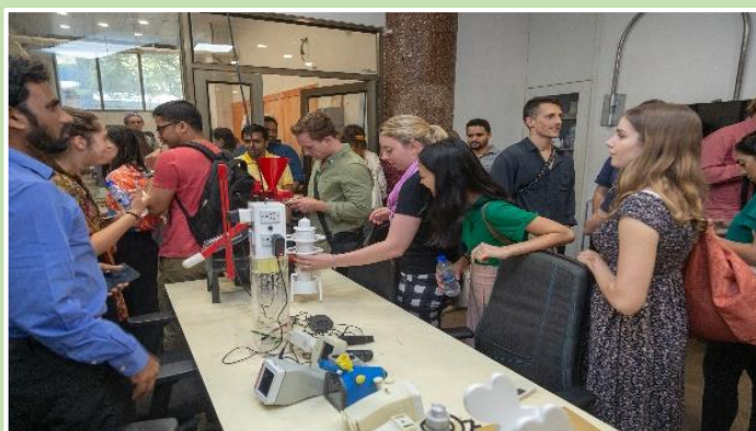
Contingent from Australia