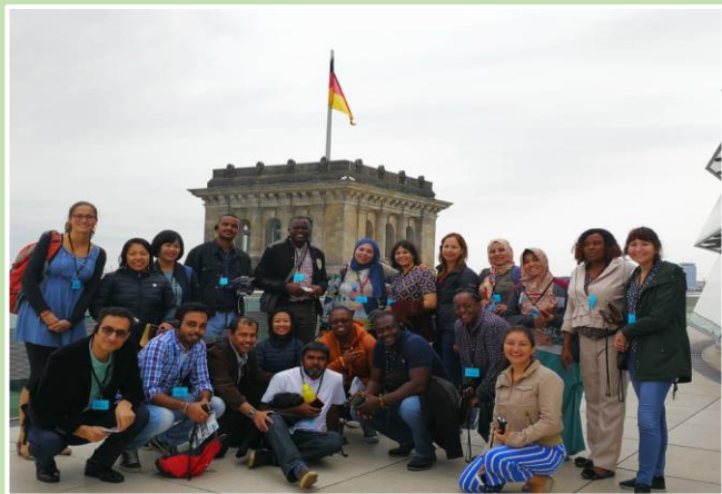
Visit to Germany

Hsinchu Science Park Bureau and Taiwan Technology Arena in order to understand their functioning and collaborate with them, eventually helping in expansion and rise of IITB Research Park.