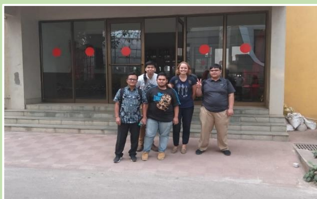
Contingent from Indonesia