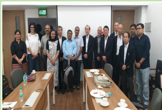
Contingent from Japan