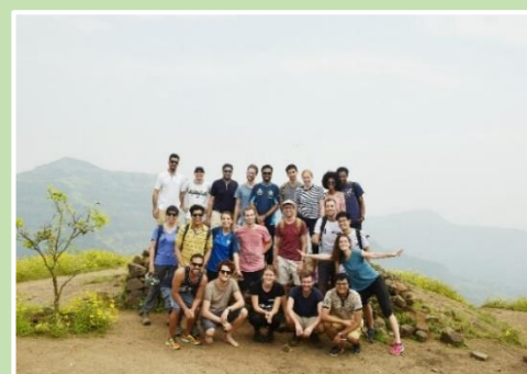
International Students - Trekking