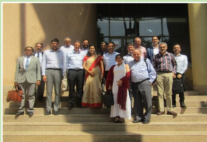
Contingent from Colombia

The Asia mission consisting of 7 director level personnel related to the Polymer Technology Executives Society from various Japanese corporations visited IIT Bombay on 19 th November, 2018. Besides an overview of International Relations Office and Research & Development Office given by respective Deans, at IIT Bombay they interacted with professors from departments of Chemical Engineering, Chemistry and Metallurgical Engineering & Materials Science and toured through the facilities at Sophisticated Analytical Instrument Facility (SAIF).