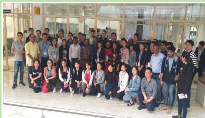
Contingent from China

A group of 49 students sponsored by the Australia Government visited IIT Bombay on 13 th December, 2018. These students were from several Australian universities: to name a few, University of New South Wales, University of Newcastle and Royal Melbourne Institute of Technology. They were interested in tech and entrepreneurship so a session was arranged with Tata Centre for Technology and Design wherein they were given the overview of the centre and its activities, introduction to the activity on stakeholders' analysis and business model planning on live projects followed by lab visit. Each group was given a Tata Centre project as a case study and was asked to either do a stakeholder analysis or model a business plan around it, based on the End to End Innovation course followed at TCTD. This hands-on activity saw the students interacting with the Tata Fellows and pitching their ideas enthusiastically in front of all. The students were a happy bunch when their groups got applauded for their new learnings.