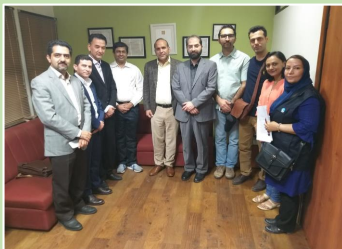
Delegation from Iranian Embassy