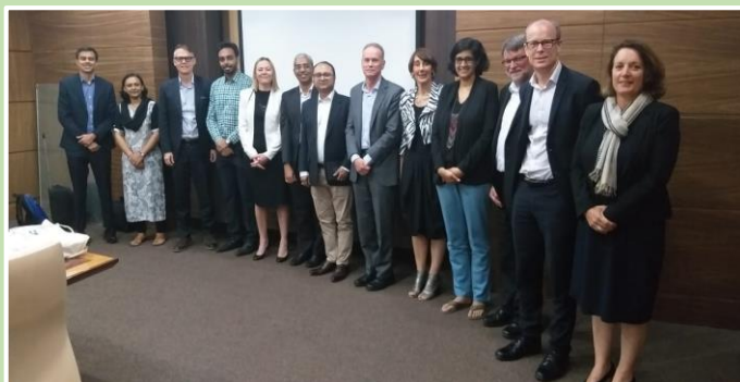
Delegation from University of Auckland